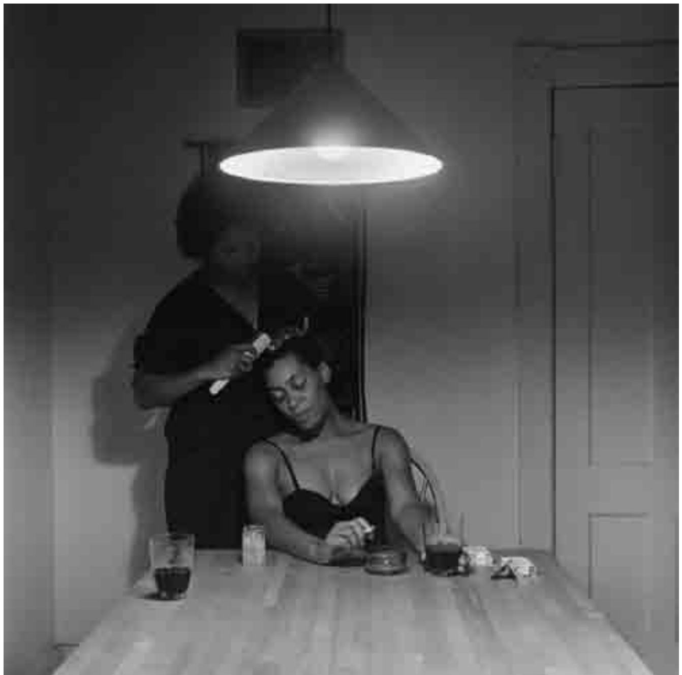
From "The Kitchen Table Series." 1990. Carrie Mae Weems, courtesy of the artist and Jack Shainman Gallery, NY

That's the way most people do so, I think that's fair.