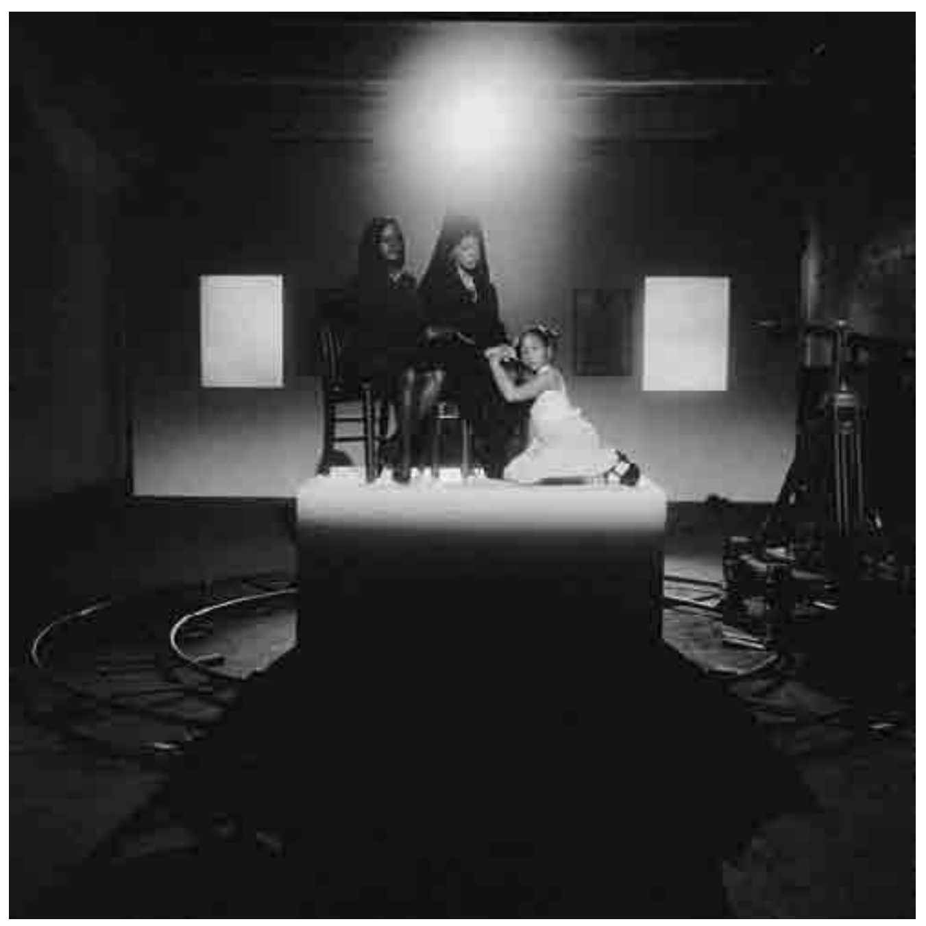
"Mourning," from "Constructing History." 2008. Carrie Mae Weems, courtesy of the artist and Jack Shainman Gallery, NY